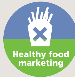
Healthy food marketing

The Healthy Canberra: ACT Preventive Health Plan 2020-2025 continues efforts to address chronic disease, aiming to support all Canberrans to be healthy and active at every stage of life. A key outcome of the Plan is to change food environments to enable healthy food and drink choices to be the easier choice.